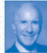
Ed Snider Chairman, Comcast-Spectacor